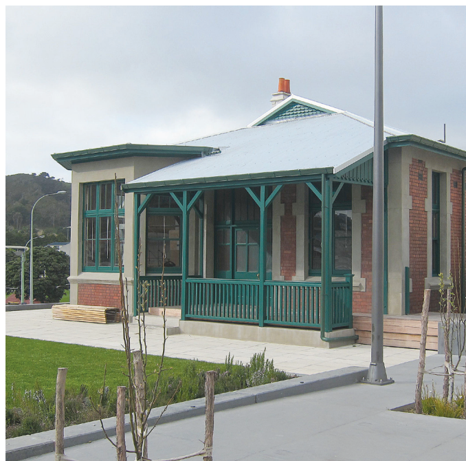
View of the beautifully restored Home of Compassion crèche building in 2015. It was constructed in 1914.

One hundred years later, it was moved 15 metres west to its current position in the War Memorial Park, which was opened earlier this year. The crèche building is currently designated for use as an education centre, administered by the Ministry of Culture and Heritage.