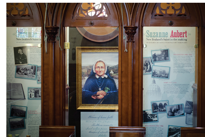
Suzanne Aubert display at St. Patrick's Cathedral, Auckland.

It is hoped that there will be several similar displays at cathedrals and churches around New Zealand and material is being prepared for distribution. Our Suzanne Aubert parish coordinators will play an important role in ensuring the material is widely circulated.